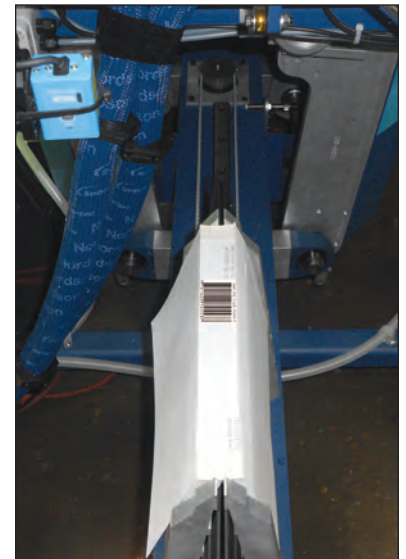
Operator just places the book block on the book carriage while the Super Sticker™ is in the home position. The ODM Book-Trac™ scanner reads the ID Barcode.