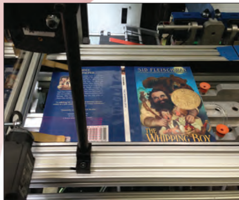
Book covers are stacked on the left conveyor belt and the ODM Book-Trac™ scanner prior to casing-in process reads ID Barcode.

Secondly, we match the cover to the manually loaded book block. If they match, we let the process continue. If they do not match, we inhibit the Super Sticker™ from being able to proceed, and visually warn the operator of the mismatch.