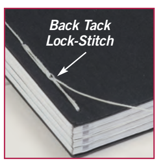
Book block up to one inch thick